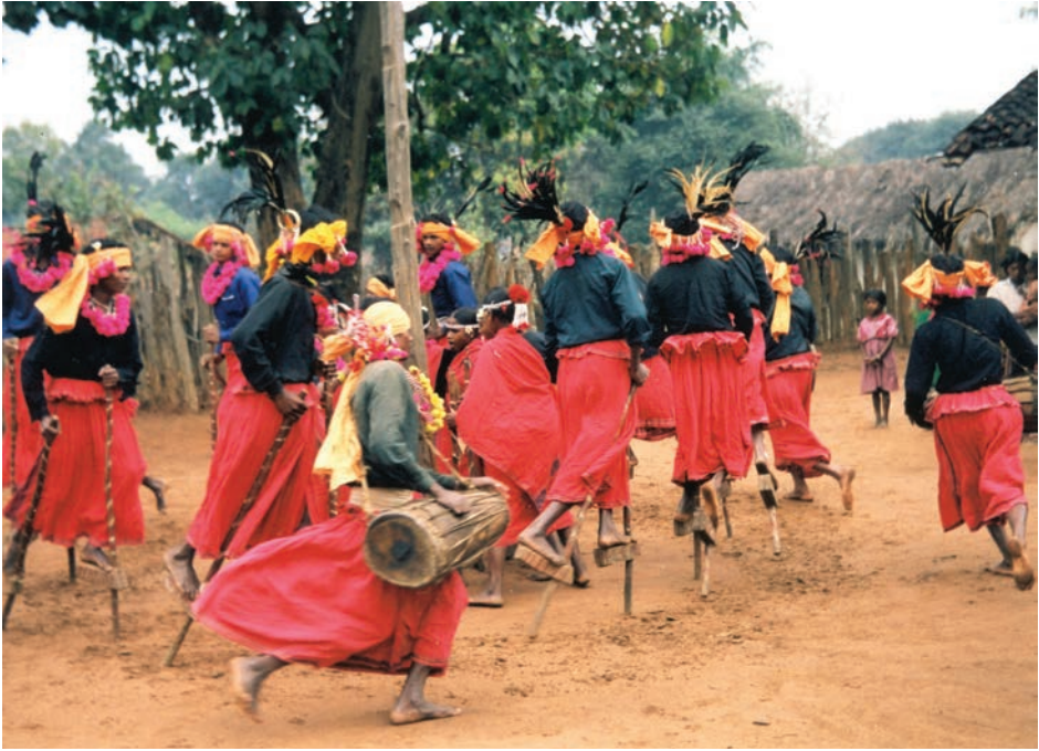
FIGURE 1. Ghotul stilt dance at Balenga Para, 2000.