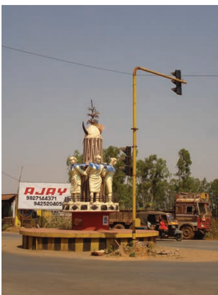
FIGURE 6. New monument at a crossroad in Jagdalpur, 2011.