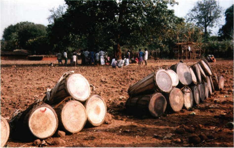
FIGURE 8. Mandir drums ready for offerings before being played at a wedding at Kharsing, 2001.

the culture of Bastar. 24 Since none of them belong to Gond culture, the question of the criteria used to evaluate the performances arises. Their own cultural references necessarily determine or affect their judgment, which consequently influences the aesthetic choices of the performers themselves. A few years ago, a Gond teacher who was a lecturer at the high school was invited to join the organization, but he did not belong to the jury. His knowledge of Hindi as well as the local languages and culture now allows him to comment on the show, which he does by addressing the various audiences with a microphone. For this special event a white turban wrapped in the tribal manner allows him to be recognized as the only ādivāsī representative among the organizers. Ironically, he does not normally wear the turban.